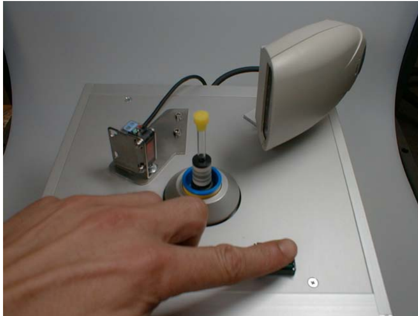
Figure 3.5. Starting the Scan Procedure

The B-BCE unit will now try to read the barcode, if the reading is successful the „Good Read“ light will light up. The motor of the B-BCE will then stop and the Tube ID will be copied into the Tube ID field of the Manual Preparation window of SampleTRACK.