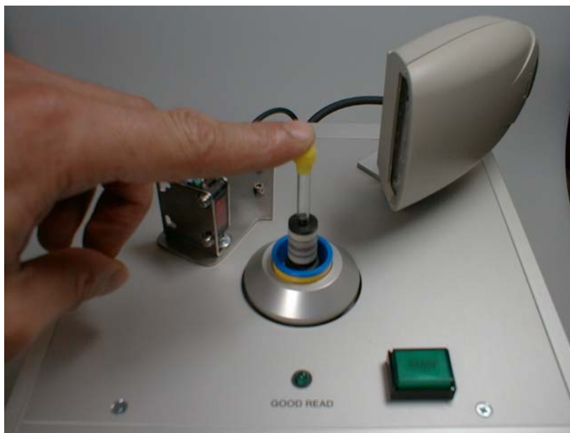
Figure 3.3. Adjusting the Depth of the NMR Tube in the Spinner