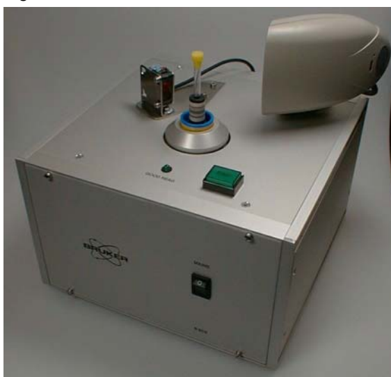
Figure 1.1. The B-BCE Unit

The B-BCE unit is connected to the keyboard of a personal computer where SampleTRACK Client or SampleTRACK Easy Dialog is installed. The B-BCE unit reads the sample barcode label and copies the Tube ID into the Manual Preparation, Tube ID field of SampleTRACK. This eliminates the need to type the information in manually.