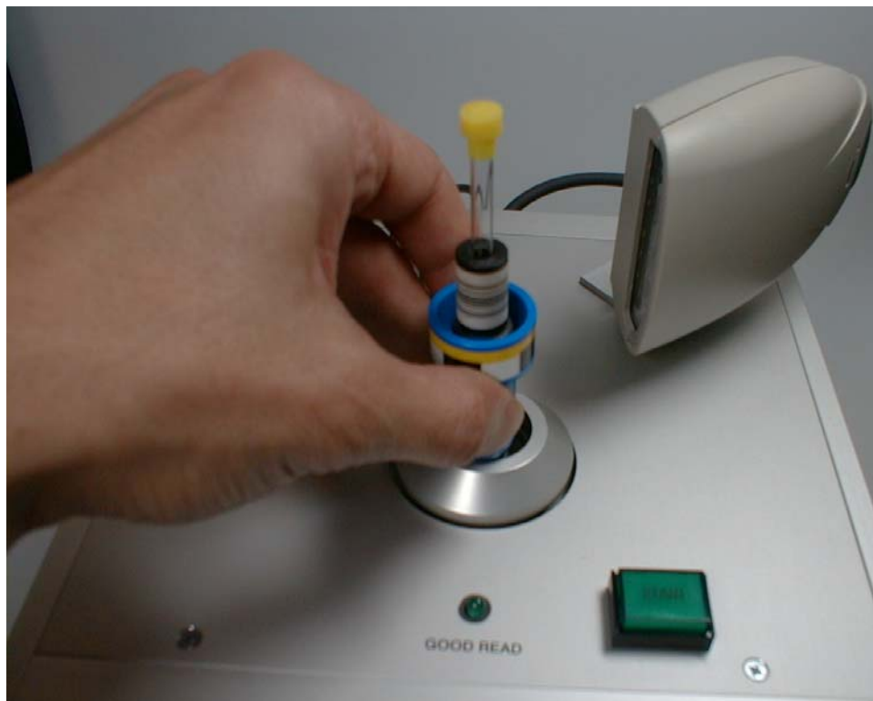
Figure 3.2. Inserting a Sample in to the B-BCE