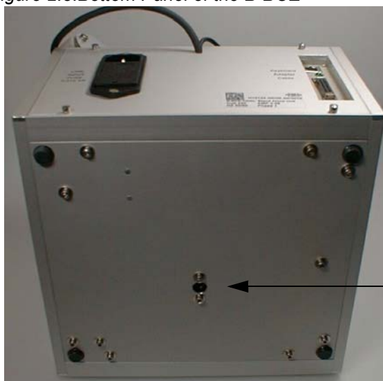
Figure 2.3. Bottom Panel of the B-BCE